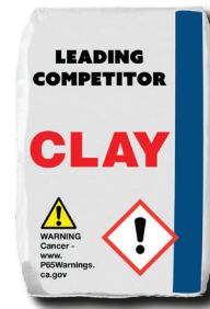
40 Quart Bag