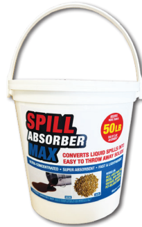
1.1 lb Space Saver Bucket

SPILL ABSORBER MAX OUTPERFORMS ANY OTHER ABSORBING MATERIAL IN EVERY PERFORMANCE CATEGORY