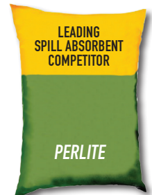
3 lb Bag