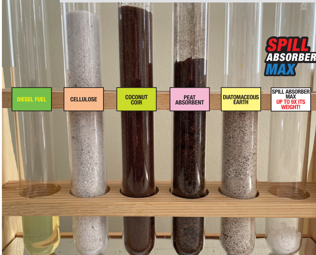
AMOUNT OF SPILL ABSORBING MATERIAL NEEDED TO ABSORB THE DIESEL SPILL

THIS DEMO SHOWS THE AMOUNT OF ABSORPTION MATERIAL REQUIRED TO ABSORB DIESEL FUEL IN THE FAR LEFT TEST TUBE. WITH AN ABSORPTION CAPACITY OF UP TO 9X ITS WEIGHT, SPILL ABSORBER MAX HAS A CLEAR ADVANTAGE OVER ALL OTHER ABSORBING MATERIALS.